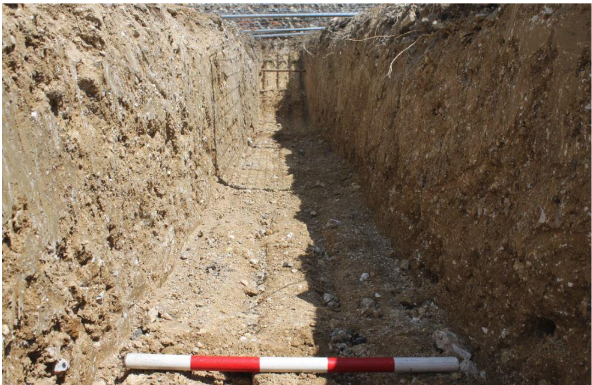
Plate 5. View of foundation trenching