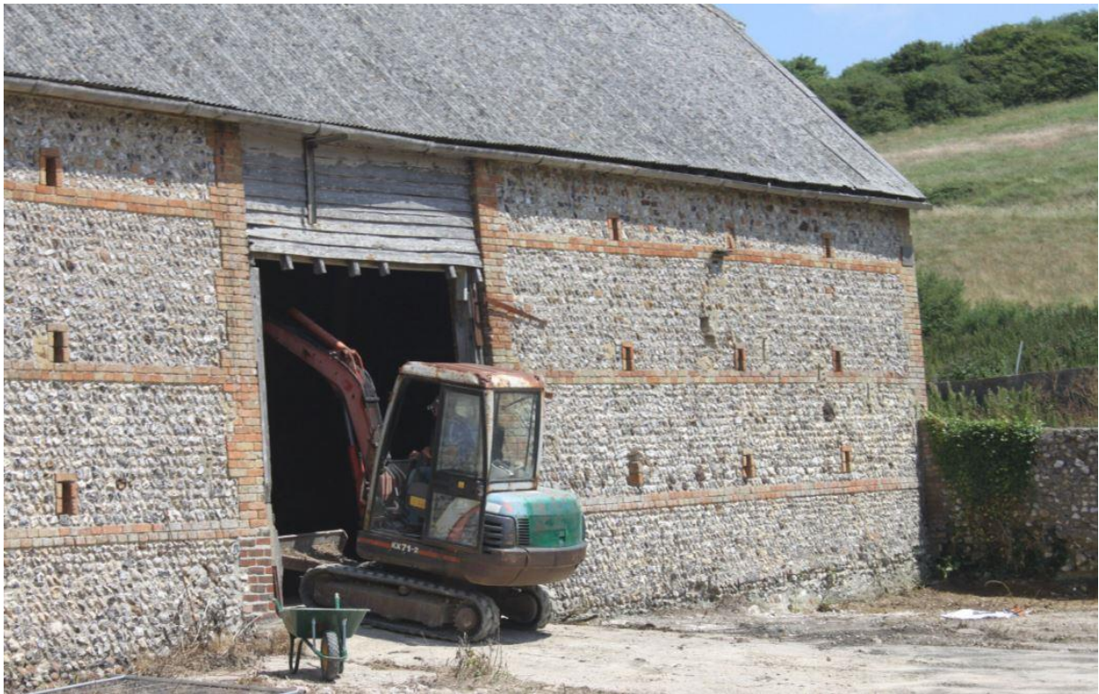
Plate 2. General view of site looking north-east