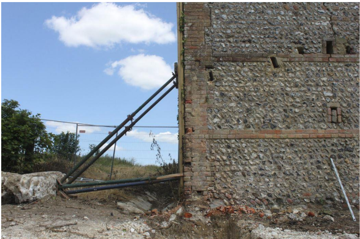
Plate 3. General view of site looking NNE