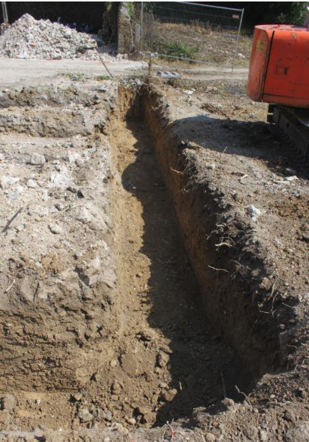
Plate 7. Completed foundations