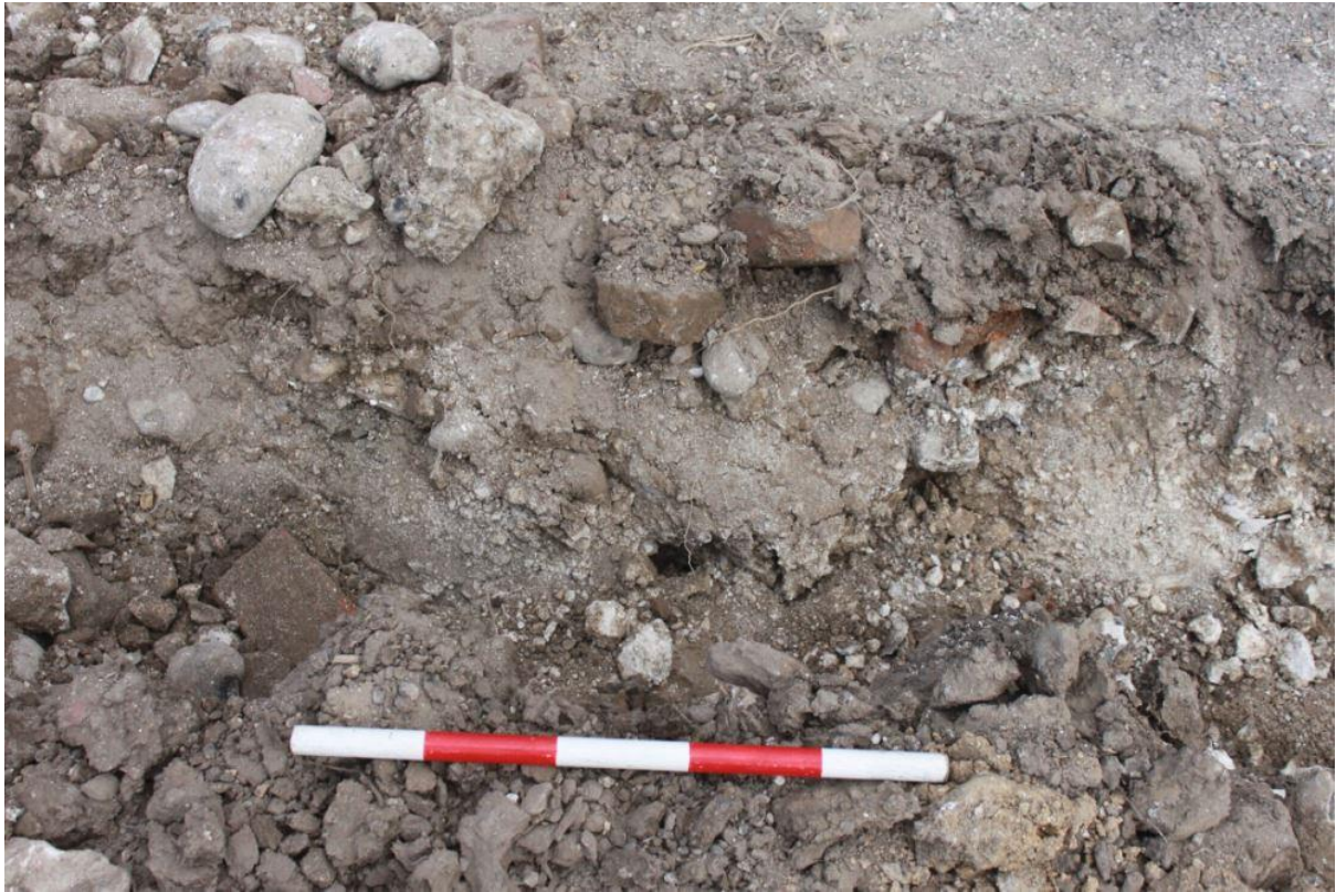
Plate 4. View of made-up ground to be removed