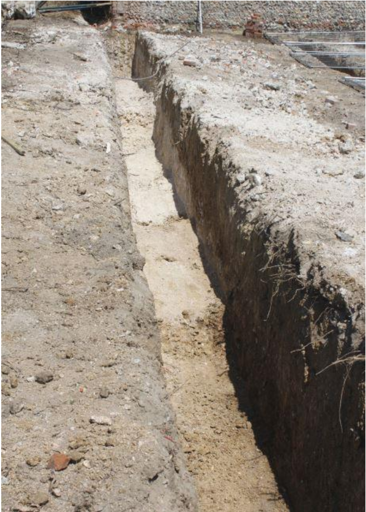
Plate 7. Completed foundation trenches