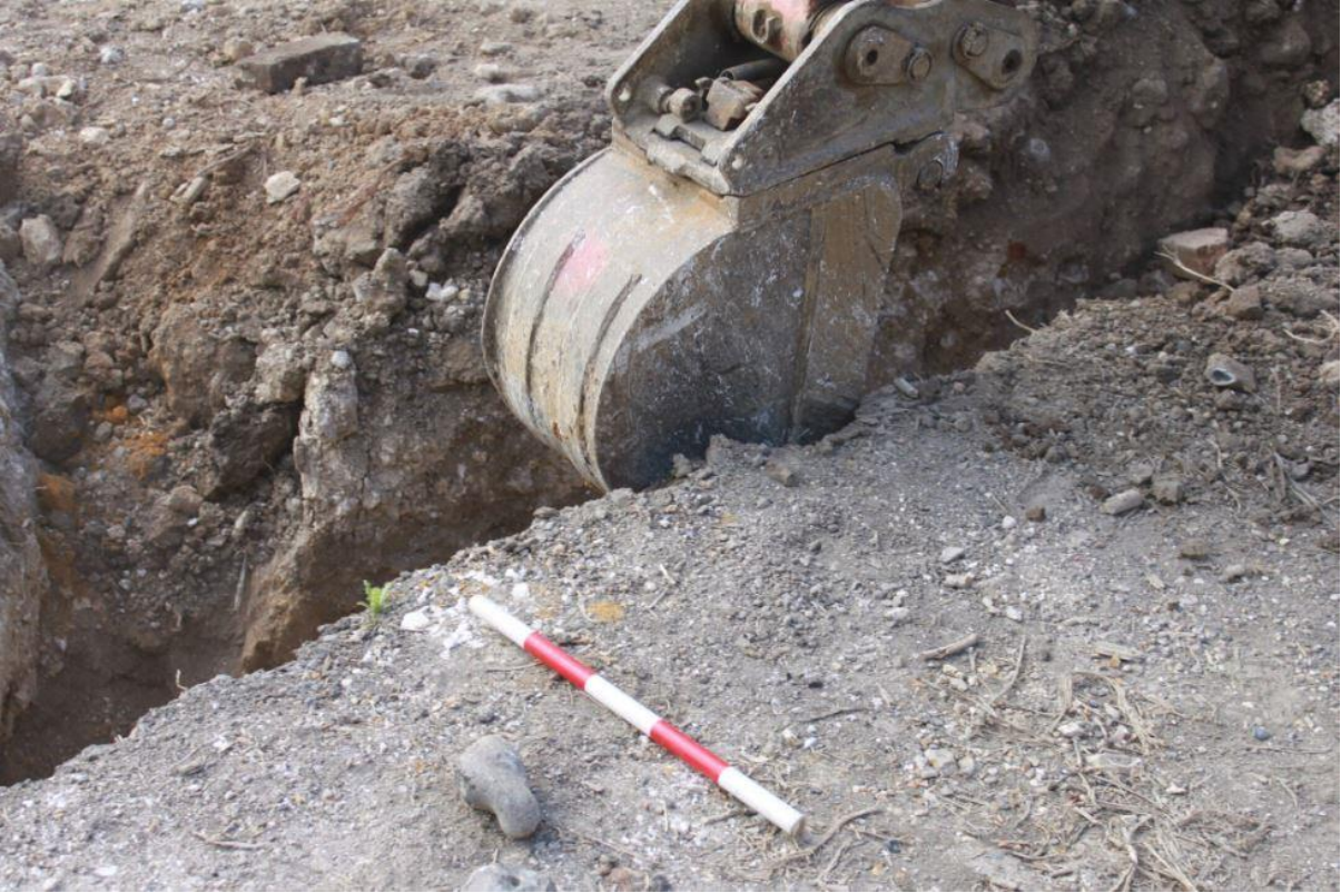
Plate 6. Cutting foundations